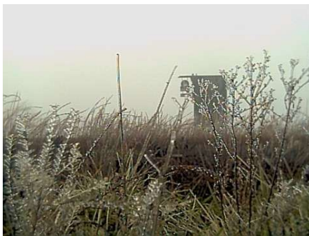
Icy fog, door stuck - oh no!