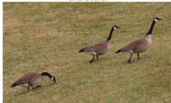
Yeah, we're back

without warning, and without relief. Here is a list of things hateful to God. Those sins are in a special manner provoking to God, which are hurtful to the comfort of human life. These things which God hates, we must hate in ourselves; it is nothing to hate them in others. Let us shun all such practices, and watch and pray against them; and avoid, with marked disapproval, all who are guilty of them, whatever may be their rank.