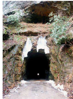
Icy tunnel. Please watch your step and bears.