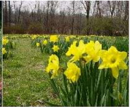
Daffodils - An Ohio meadow.