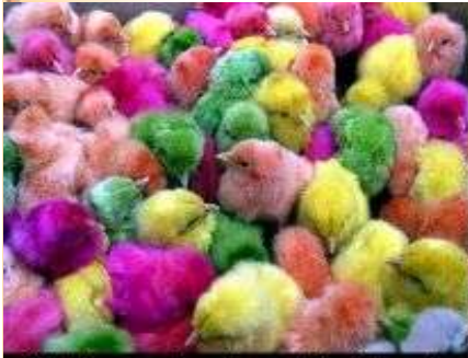
What happens when hens eat Fruit Loops!