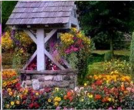
A flowering spring well.