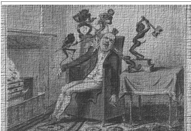
Monkeys? Yeah, pay no mind. They go away after a few casks of tasty spirits.