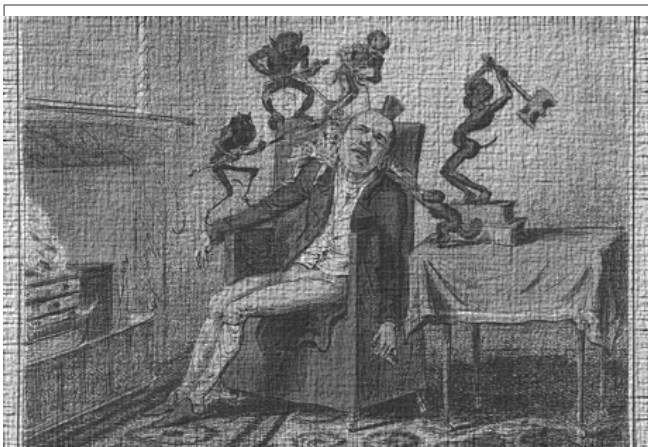
Monkeys? Yeah, pay no mind. They go away after a few casks of tasty spirits.

How many times have we all heard Mom say something akin to, "Now, don't get too close to the stove, you might get burned." That statement has