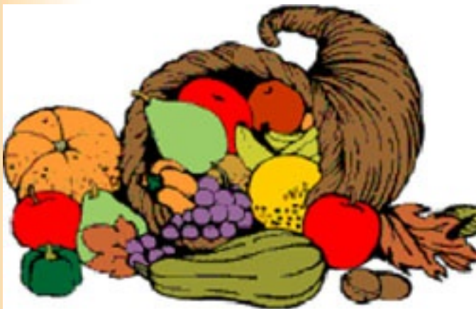
The latter harvest begins at Feast of Trumpets