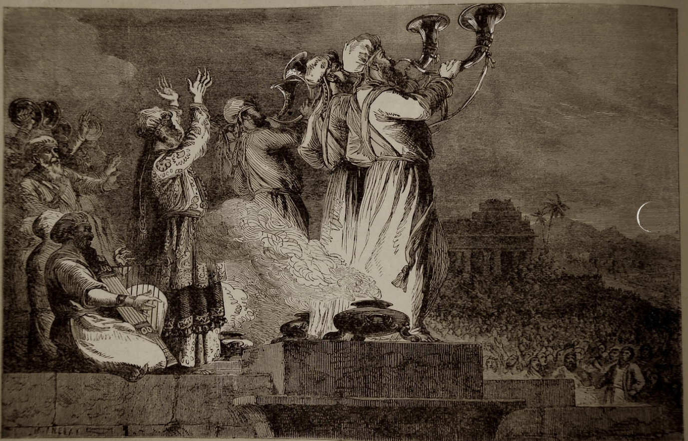
BLOWING THE TRUMPET AT THE FEAST OF THE NEW MOON.

“There is also a festival on the day of the paschal feast which succeeds the first day, and this is named the sheaf, from what takes place on it; for the sheaf is brought to the altar as a first fruit both of the country which the nation has received for its own, and also of the whole land; so as to be an offering ... for the nation...” ~ Philo, The Special Laws I – Part 3: The Sixth Festival, XXIX. (162)