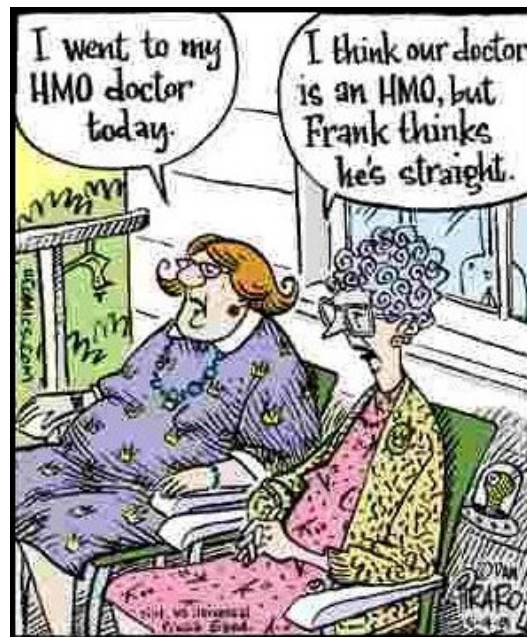
Getting older requires a sense of humor.

Happiness is nothing more than good health and a bad memory.